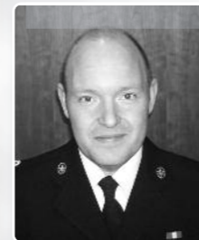
Superintendent Craig Guildford

SUPERINTENDENT Guildford discussed the Area's performance which had seen reductions of 8%, 2%, 10%, 19% and 17% in all crime, domestic burglary, violent crime, vehicle crime and criminal damage respectively compared with the same period last year. Details were also circulated of recent operations and local incidents of note.